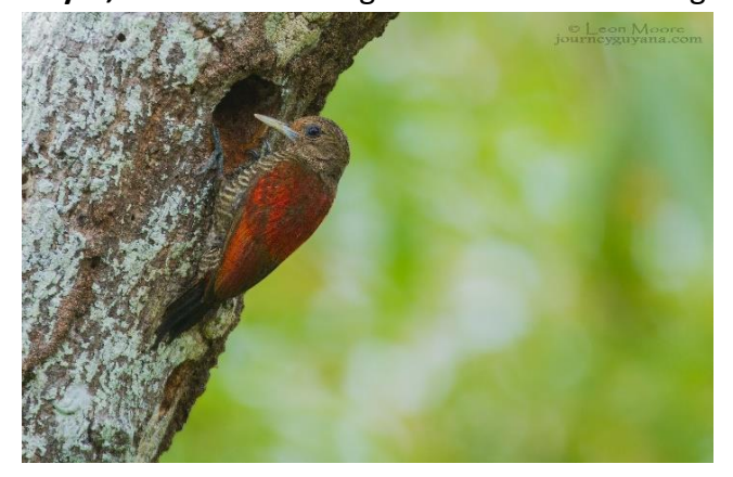
Day 1, Our tour will begin from the Cheddi Jagan International Airport. You tour leader Leon

Moore or driver will be waiting to collect you from the Airport and transfer you to your hotel. The driver from the airport can take approximately 1 hours during the late hours of the night or up to 2 hours depending on the flow of traffic during the day time. Georgetown is located in the north of Guyana on the Atlantic coast, and about a one-third of the Country's population lives in this English speaking metropolis.