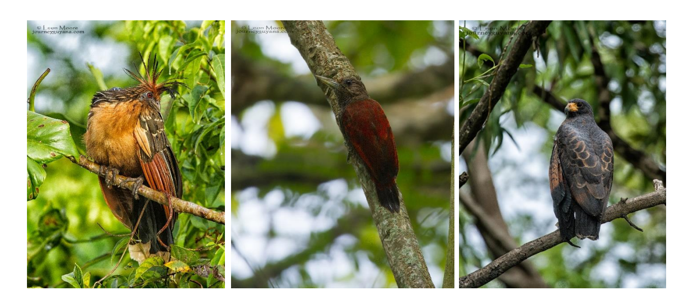
Day 2, Mahaica River tour, Bounty Farm or Botanical Garden Tour.

Hoatzin Blood-coloured Woodpecker Rufous Crab-Hawk