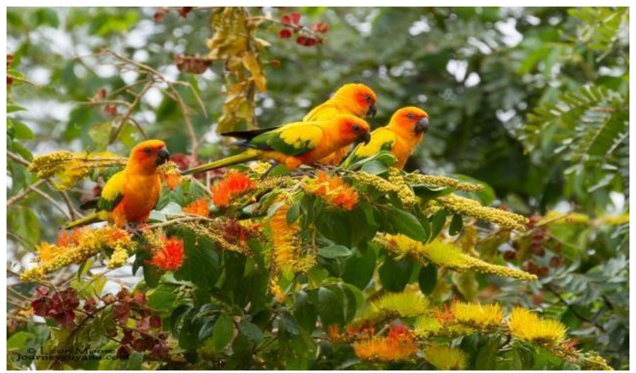
Day 9, Caiman House to Karasabai: This morning we will continue on our journey to Karasabai on rough road passing through very nice habitats such as open savanna and the Pakarima mountain range with gallery forest patches. Here Aplomado Falcon hunts over expansive plains with Grassland Yellow-Finches mixed with a variety of seedeaters, including Gray, Plumbeous, Chestnut, Ruddy and Lined Seedeaters. We also have good chances of encountering Giant Anteaters as they pass through the savanna. We will be passing lots of ponds, so these spots should produce very good birding opportunities for water birds such as herons, egrets and storks. We'll need to keep an eye overhead as well for the raptors likely for this area: Savanna and White-