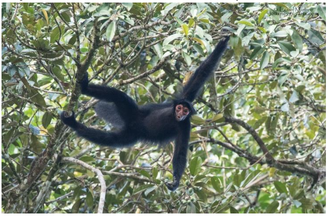
(Black Spider Monkey)

perched in the trees at the forest edge at the Lodge.