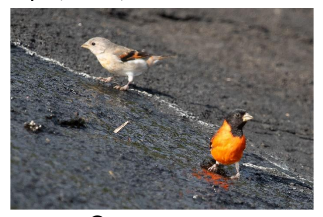
(Red Siskin)

in search of the highly endangered Red Siskin. A fairly large population of Red Siskin was discovered in this region in 2003, far removed from any previously known colony, and we stand a good chance of observing this strikingly plumage species with an estimate world population of 600-6000 pairs. Our main objective will be to focus on locating the Siskin as this activity is just for one day at this stage of the tour and also due to the very long distance