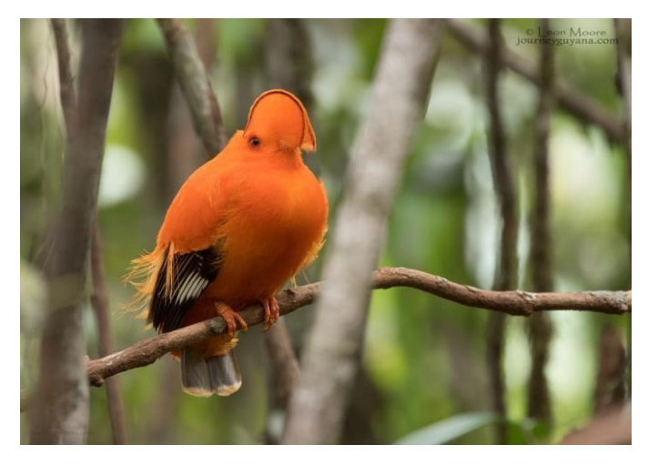
Day 6,14th Oct Atta Rainforest Lodge to Surama Lodge via Cock-of-the-Rock Lek: Today we will