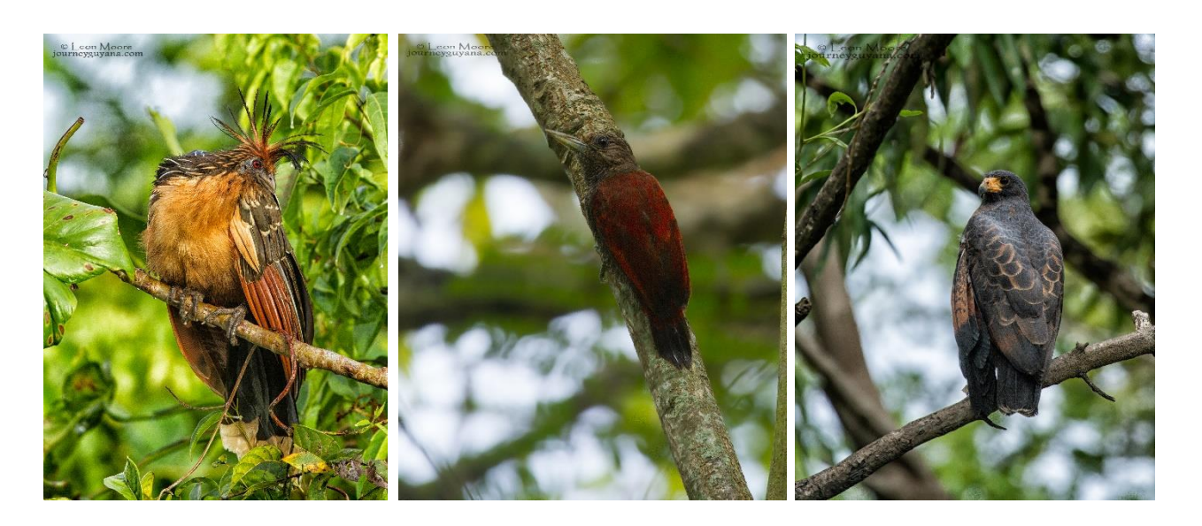
Day 2, 10<sup>th</sup> Oct, Mahaica River tour, Bounty Farm or Botanical Garden Tour.

Hoatzin Blood-coloured Woodpecker Rufous Crab-Hawk