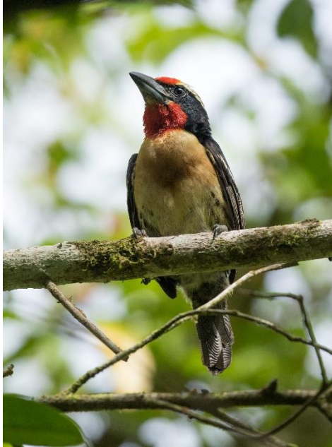
(Black-Spotted Barbet) in Guyana.

Day 13, 26 th Mar, Atta Lodge to Georgetown: This morning, we will have another opportunity to