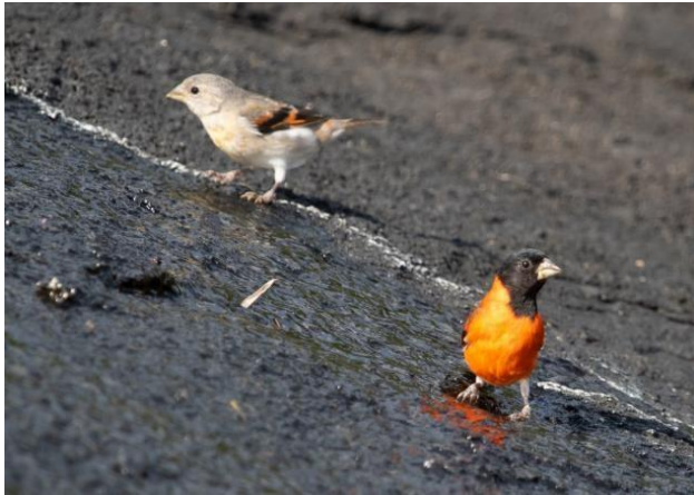
(Red Siskin)

Day 3, 16 th Mar, Georgetown to Whichabai: Today will be an early start; we will leave our hotel around 5:15am and transfer to the nearby Ogle Airport to check in and continue to Lethem. The