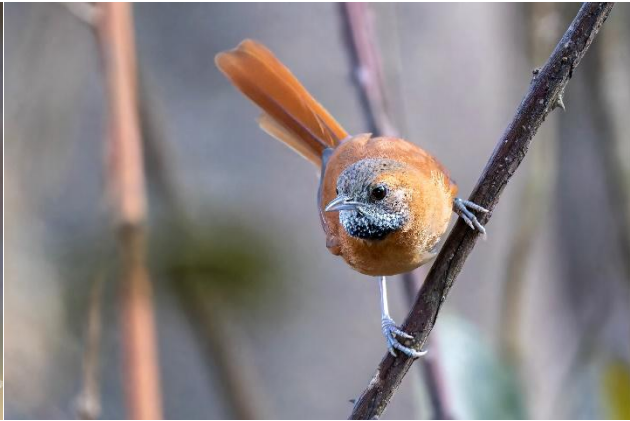
( Hoary-throated Apinetail)

Day 3, 23 rd Mar, 2026. Georgetown to Manari Ranch. Today you will be transferred to Ogle Airport where you will connect with your scheduled flight to Lethem. Lethem is the capital of Region 9 and is a hub linking many of the surrounding villages to Georgetown. The Takutu River Bridge over the Takutu River was recently completed and now links the two countries.